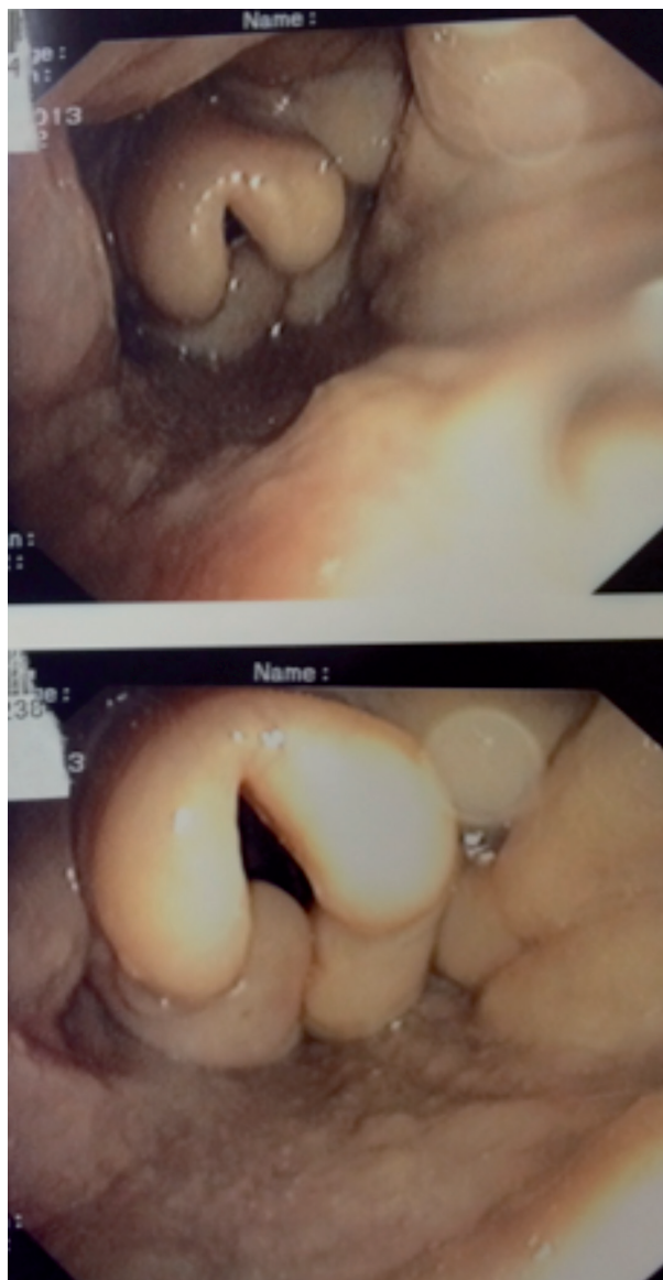
Fig. 1. Sarcoidosis with laryngeal involvement

Central Nervous System (CNS) (n=5, with 2 cases of diabetes insipidus) and heart (n=4). Skin lesions were notably frequent with lupus pernio associated with sinonasal involvement in 6 patients (50%).