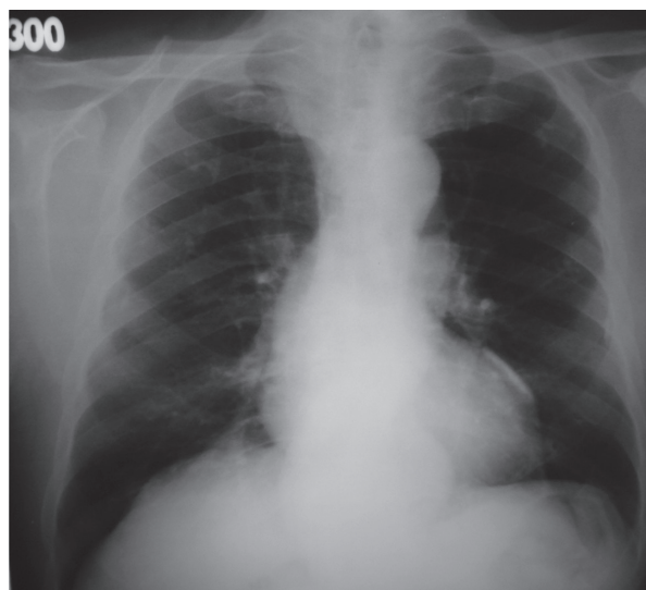
Fig. 1. Diaphragmatic plaques on the right and pericardial calcified pleural plaques on the left with lung radiography

values recorded. (Figure 1) Longest diameters of both hemidiaphragmatic PP and pericardial plaques measured at 3 axis and the values were recorded. Lung volumes taken as the longest diameter in the axis measured and recorded (Figure 2). Craniocaudal distance was measured from the tracheal line in the coronal plane, and transverse and anterior-posterior distances were measured at the right mid lobe bronchi branching line in the axial plane. PP volume measured was divided by lung volume to determine PP ratio.