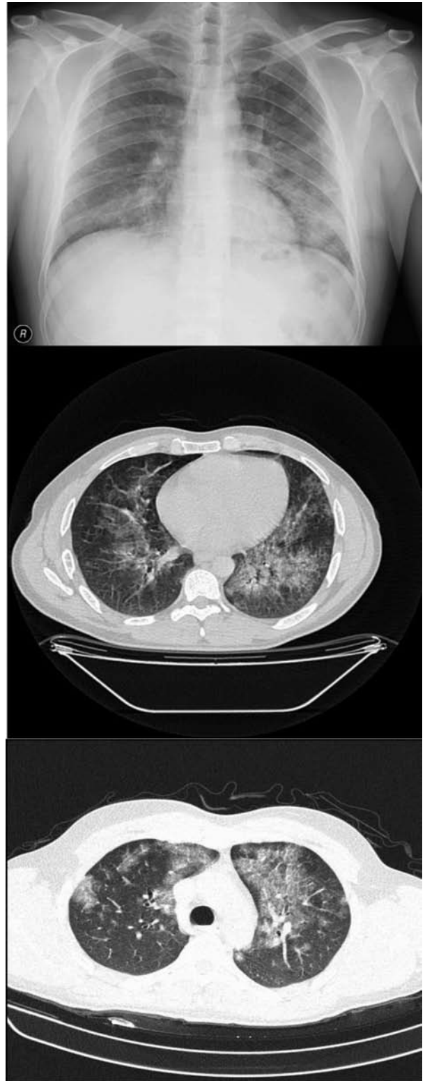
Fig. 1. Chest X-ray and computerized tomography of the patient