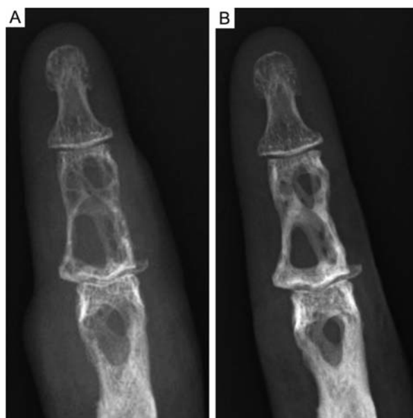
Fig. 2. Radiographs of right hand forefinger before (A) and one year after (B) the administration of ITCZ. Multiple cystic lesions gradually reduced with marked improvements in both density and thickness of the bone cortex. A remarkable swelling of soft tissue also improved.

Concerning the present case, her good clinical course indicated that itraconazole improved not only the pulmonary aspergillosis but also osseous and skin involvements without corticosteroids. As far as we know, there is only one report describing the usefulness of itraconazole in combination with corticosteroids for pulmonary sarcoidosis without fungal infection (4). However, our case is different from this report in four points: i) corticosteroid was not applied to our case, ii) our case was infected with aspergillus, iii) our case showed a remarkable im-