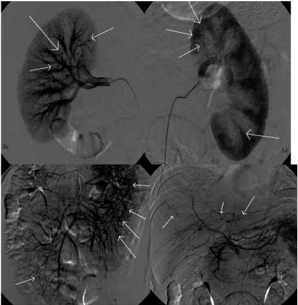
Fig. 2. Multiple small aneurysms in both renal arteries, small bowel branches, mesenteric arteries, branches of intercostals artery and hepatic artery suggesting systemic vasculitis such as polyarteritis nodosa

82.2%, and a reported specificity of 86.6% for the classification of polyarteritis nodosa compared with other vasculitides (13).