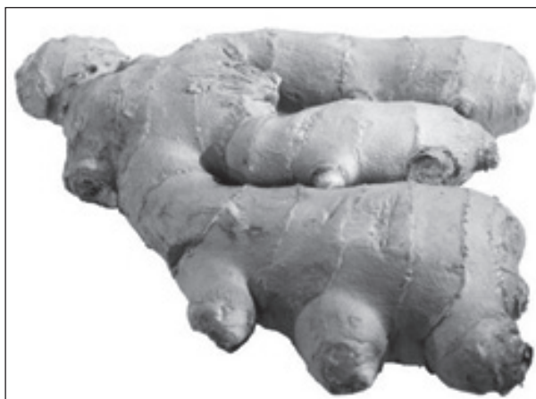
Figure 10. Zingiber officinale Roscoe (Ginger)

Emblica officinalis (Fig. 9) is used both as a medicine and tonic for vitality and strength. According to the two main classic texts on Ayurveda, Charaka Samhita , and Sushruta Samhita , Emblica officinalis is considered as “the best among rejuvenation herbs” and “the best among the sour fruits” for relieving cough and skin diseases. All parts of the plant are used for medicinal purposes. The fruit pulp is used in several indigenous medical preparations for treatment of diabetes. ‘Triphala’ a mixture consisting of three components (equal proportion of Terminalia chebula , Terminalia bellerica , Emblica officinalis ) (100 mg/kg body weight) were administered orally in normal and alloxan-induced diabetic rats significantly reduced glucose levels within 4 hours. (62). In Unani medicine, Emblica officinalis is described as a tonic for the heart and brain. Indian gooseberry is the richest source of vitamin C and has been shown to lower glycosylated hemoglobin levels in diabetic patients. Aqueous extract of Emblica officinalis consisting of hydrolysable tannoids was shown to inhibit aldose reductase (enzyme responsible for the reduction of glucose to sorbitol) in a rat model of cataract and may explore the usefulness in the management of diabetic complications (63). It has been reported that the polyphenols, tannins, alkaloids, and phenols of Emblica officinalis appears to be mediated by direct insulin-like or insulin mimetic effect in diabetic conditions (64).