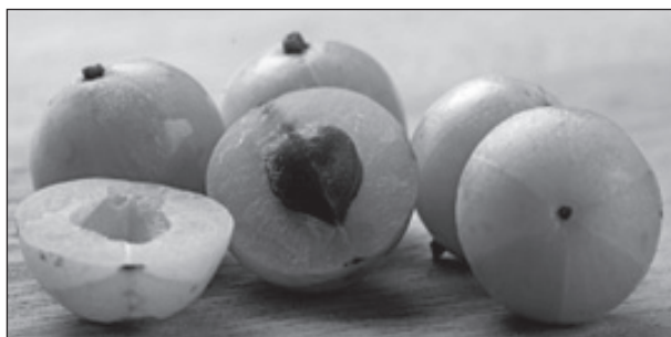
Figure 9. Emblica officinalis (Indian Gooseberry)

A recent review was published by Rathinamoorthy et al (2014) on the pharmacological and biochemical effects of Terminalia chebula such as fruit, leaf, and bark extracts (60). Bag et al. (2013) reported information related to the phytochemical and various medicinal properties of Terminalia chebula against human diseases (61). Major ingredients of Terminalia chebula are ellagic and gallic acids which are potent antioxidants.