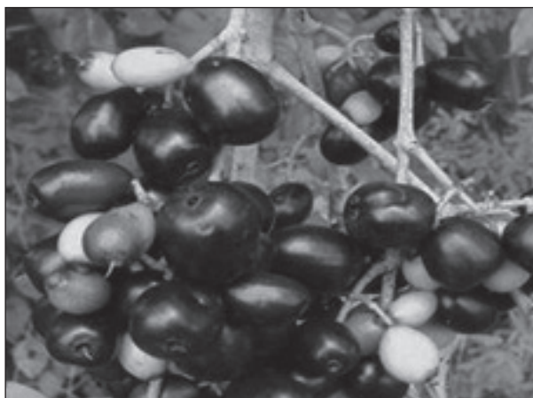
Figure 6. Eugenia jambolana (Blackberry)

Recent studies are described here to explore the anti-diabetic nature of fenugreek. Neelkantan et al. (2014) reported a meta-analysis of clinical trials based on the effects of fenugreek on human subjects. This recent clinical trial on fenugreek evaluated the beneficial role of fenugreek seeds on glycemic control in participants with diabetes (40). Fenugreek is easily available for little cost in countries such as India and China where large populations have type 2 diabetes. Kumar et al. (2012) reported that fenugreek seed powder can reverse hyperglycemia in diabetic rat brains. Fenugreek also was shown to reduce lipid peroxidation and enhances antioxidant activity in diabetic rats (41). Premanath et al. (2012) evaluated the role of fenugreek leaf extract in STZ-induced diabetic rats and observed