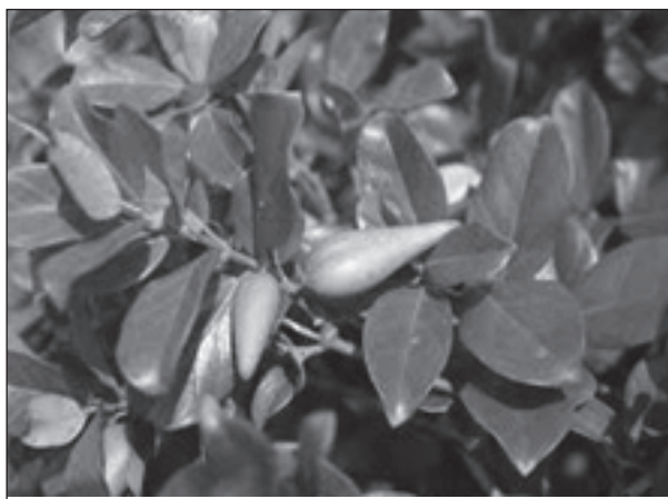
Figure 4. Gymnema sylvestre (Periploca of the woods)

Gymnema sylvestre (Fig. 4) a woody climber of the Asclepiadaceae family, has well known therapeutic potential and plays a key role in Ayurvedic medicine for