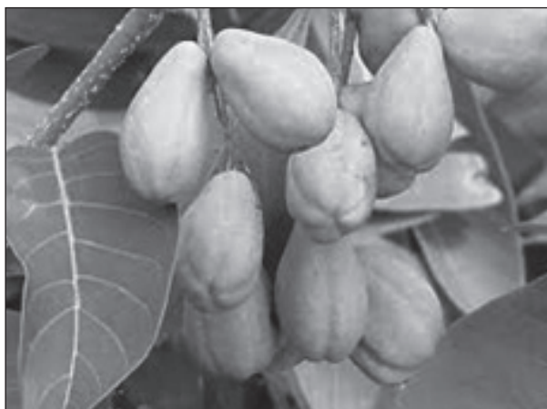
Figure 8. Terminalia chebula (Chebulic Myrobalan)

Aegle marmelos (Fig. 7), commonly known as stone apple or bael, belongs to the family of Rutaceae, which is widely used in Ayurvedic medicine for treatment of diabetes mellitus. Several research groups in India and other South Asian countries have examined the hypoglycemic activities of its plant extracts. The plant is rich in alkaloids, among which marmesin, marmin, aegline, and marmelosin are the most important chemical compounds with hypoglycemic properties (52). Aqueous extract of Aegle marmelos leaves (1 gm/kg for 30 days) was shown to significantly restrain blood glucose, urea, body weight, liver glycogen and serum cholesterol levels in alloxanized (60 mg/kg i.v) rats as compared to controls, and this effect was similar to insulin treatment (53). Aqueous leaf extract administered orally for 28 days also normalized STZ (45mg/kg body weight)-induced histopathological alterations in pancreatic and kidney tissues of rats (54). Aqueous leaf extract (1 gm/kg/day) fed to STZ (45 mg/kg i.v) diabetic rats for 2 weeks resulted in reduction of malate dehydrogenase levels (an enzyme elevated in diabetes) in comparison to diabetic controls. The extract was similarly effective as insulin in restoring blood glucose and body weight to normal levels (55). Methanolic extract of leaf and callus powder