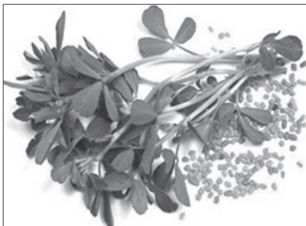
Figure 5. Trigonella foenum graecum (Fenugreek)

seeds has been reported in experimentally-induced diabetic rats, mice, and healthy volunteers (both type 1 and type 2 diabetes) (34, 35). Aqueous extracts of fenugreek seeds and leaves have been shown to possess hypoglycemic activity and are non-toxic (36), but there has been no detailed study elucidating the mechanisms of action of these extracts at the cellular and molecular level. However, extensive in vitro activity of fenugreek was evaluated in 3T3 L1 adipocytes. It was found that lyophilized fenugreek powder dissolved in phosphate-buffered saline (PBS) had a marked effect on glucose uptake in 3T3 L1 adipocytes by GLUT4, insulin receptor substrate-1, insulin receptor \beta subunit, and phosphatidylinositol 3-kinase (PI3-kinase) (37). Diosgenin ( C_{27}H_{42}O_3 ), a naturally occurring aglycone obtained from fenugreek, exhibited anti-diabetic potential in animals as well as in humans (38, 39).