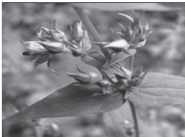
Figure 3. Swertia chirayita (Chiretta)

Swertia chirayita (Fig. 3) is a medicinal plant indigenous to India, Nepal, Bhutan, Pakistan, Bangladesh and Tibet. The phytochemical Swertiamarin, an active compound isolated from Swertia chirayita , was shown to have anti-diabetic properties in vitro (20). Oral administration of the ethanolic extracts (95%) and hexane fraction of Swertia chirayita (10, 50 and 100 mg/kg) to normal, glucose-fed, and streptozotocin (STZ) induced diabetic rats significantly lowered blood glucose in all groups of animals (21). Alam et al (2011) evaluated the hypoglycemic effect of whole Swertia chirayita plants and leaves (22).