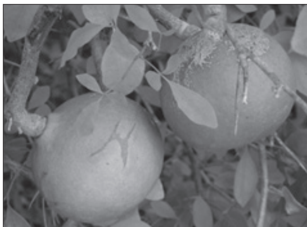
Figure 7. Aegle marmelose (Stone apple or bael)

fruit-pulp extracts are known to stimulate synthesis of insulin from residual \beta cells (49). Eugenia jambolana extract has been shown to up-regulate glucose transporter GLUT4 and activate peroxisome proliferator-activated receptor gamma (50). It has been reported that ethanolic extract of seeds of Eugenia jambolana had shown significant anti-diabetic activity and potential protective effect in diabetic nephropathy (51).