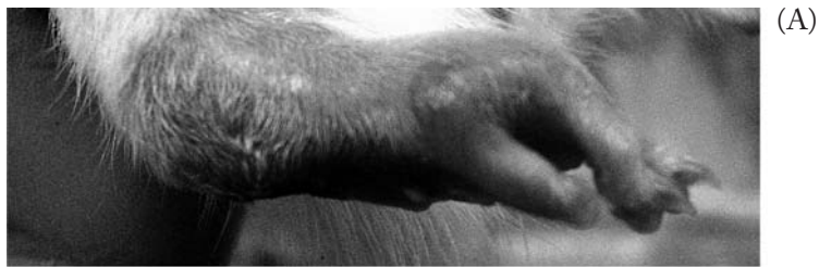
Figure 1 - See text for legend (Adapted from Ref. 23, with permission from the authors)