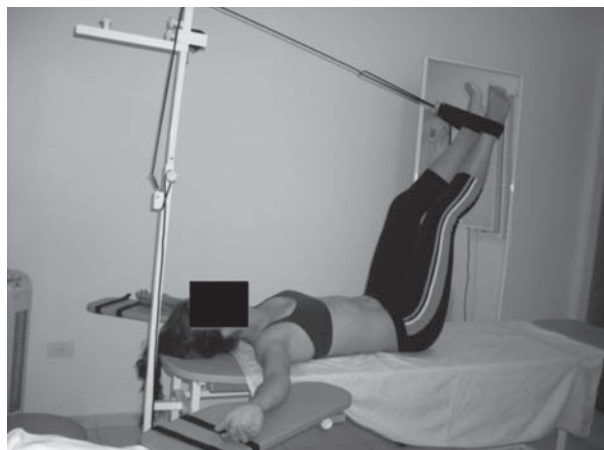
Figure 2 - Lying supine GPR posture with abduction of the upper limbs and progressive hips flexion and knees extension, mainly stretching posterior muscles.