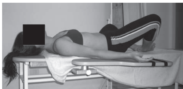
Figure 1 - Lying supine GPR posture with adduction of the upper limbs and progressive extension of hips and knees, mainly stretching anterior muscles

The physiotherapist applied manual traction to cervical and lumbar regions during both GPR treatment postures to align the spine along a straight axis. The physiotherapist used verbal commands and manual contact to maintain the alignment, and made the necessary postural corrections to optimize global stretching and eliminate postural compensatory movements (2).