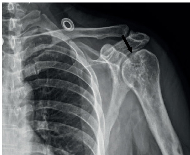
Figure 1. X-ray of the shoulder joint.

Although bone disorders in compressed air tunnel workers and divers have been known for many years, it has become understandable after the discovery of X-rays. DON was diagnosed for the first time in compressed air tunnel workers by bone X-ray in 1911 with two different studies. The first diagnosis of DON in divers was much later, in 1941. In the later years, especially after accepting this disease as an occupational disease, studies on the frequency of DON were conducted in various countries and different occupational groups working in compressed air [3]. The prevalence of DON varies considerably between different countries, and in some countries, including our country (Hawaii, Korea, and Japan), the high prevalence is most likely due to the lack of