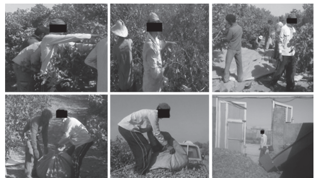
Figure 1. Examples of tasks during pistachio harvest

The present study was conducted in two phases. The first phase was in September and October 2019 and the second phase in August, September and October 2020 (the yearly harvest and processing of pistachios begin in early September and continue until