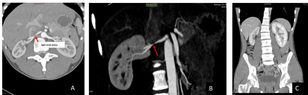
Figure 2. Upper abdominal CT Scan with contrast injection (A) and Magnetic Resonance Imaging (B) showing a narrowing of medium-distal portion of the right renal artery and (C) kidneys asymmetry.