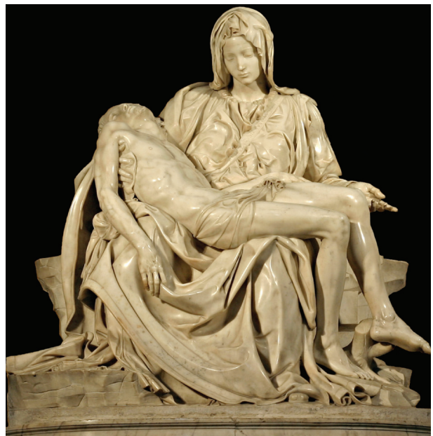
Figure 1. The Vatican's Pietà , sculpted by Michelangelo Buonarroti in 1498-9 [Marble, 174 x 195 cm, St. Peter's Basilica, Rome/Italy].

According to accounts, the day the statue was unveiled, Michelangelo hid behind a column in St. Peter's Basilica, waiting for the crowd to applaud him and the critics to praise his name. Instead, he heard people