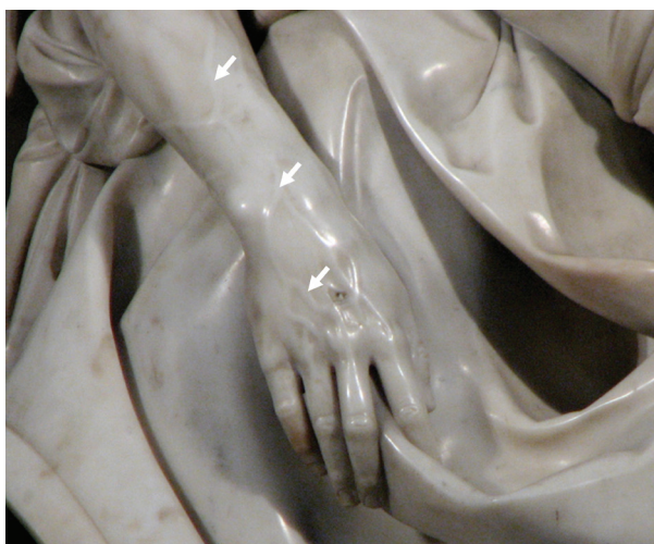
Figure 4. Detail of the distribution of the veins [ arrows ] on the surface of the forearm and hand of Jesus Christ in the Vatican's Pietà . Michelangelo Buonarroti (1498-9) [ Marble, 174 x 195 cm, St. Peter's Basilica, Rome/Italy ].

What is more, even if all the elements identified in this manuscript present a great challenge to any artist, especially to a young man of only 24 years of age; we cannot forget that Michelangelo's entire intellectual training [ since the age of 15 ] had been based on the Neoplatonic teachings of Marsilio Ficino and Pico della Mirandola ; who often very clearly argued that