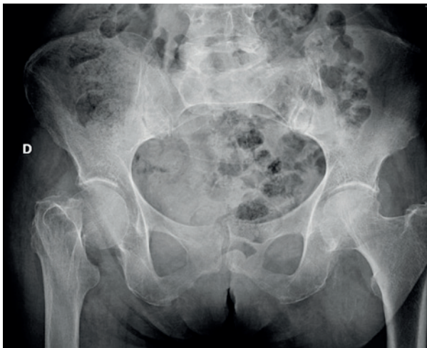
Fig. 1 Femoral neck fracture at pelvis x-ray

Skin incision is performed from the tip of the greater trochanter and extended proximally in line