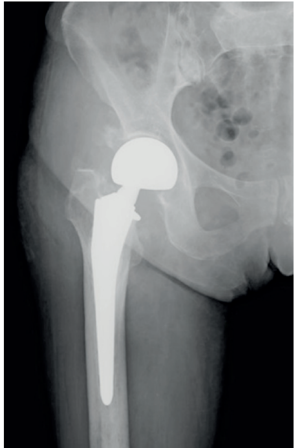
Fig. 2 Radiographic follow-up at 6 months after surgery

with femur shaft axis for a length of 6 to 8 cm. (fig.3). Generally, a longer exposure is required for overweight patients. The muscular fascia is opened in line with skin incision to expose the gluteus maximus that is carefully splitted in line with its fibers to expose the underlying gluteus medius. The gluteus medius muscle is then retracted anteriorly to show both piriformis tendon and gluteus minimus. Subsequently, the piriformis is spared. Using the interval between the gluteus minimus and the piriformis, a Hohmann retractor is placed under the gluteus minimus, over the anterior edge of the acetabulum. Slightly lifting the knee to reduce the tension on the piriformis, a second retractor is placed beneath the piriformis to protect it. Then the capsule is incised superiorly from the trochanteric fossa proximally to the superior acetabular rim at approximately 12 o'clock position. A