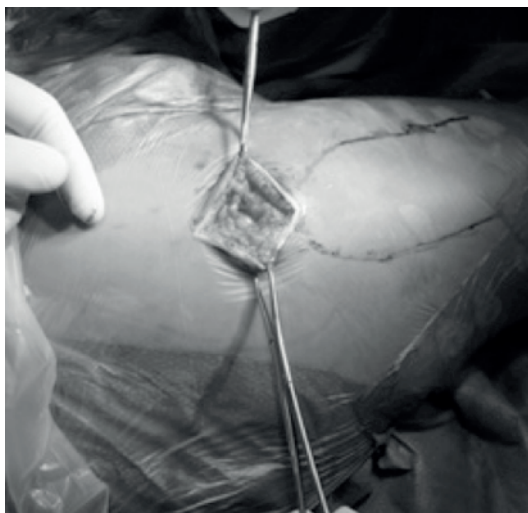
Fig. 3 Skin incision from the tip of greater trochanter extended proximally in line with femoral shaft axis

blunt Hohmann retractor is placed between the posterior capsule and the posterior femoral neck, and a second Hohmann was disposed between the anterior capsule and the anterior femoral neck; the femoral neck is fully exposed, and the fracture can now be visualized. The femoral head is left in place and the femoral neck fracture is re-aligned in order to have a proper guide for the version of the femoral neck. Moreover, leaving the femoral head and neck in situ during this part of the procedure, we provide stability to the femur during the broaching phase. The femoral canal is opened through the trochanteric fossa with a cylindrical reamer. Then the femur is prepared with progressive broaches. It is broached up to the final size and at this point a one size smaller broach is positioned inside the femoral canal. Using the top of the broach as a cutting guide, the femoral neck osteotomy is completed. The femoral head is then removed using a Shanz Screw and the final cemented stem is placed into the femoral canal. Then a bipolar femoral head is inserted into the acetabulum and the prosthesis implant is reduced. (fig. 4). At this point the capsule is sutured and gluteus minimus and medius are returned to their native positions removing the retractors. Finally, fascia, subcutaneous and skin are sutured.