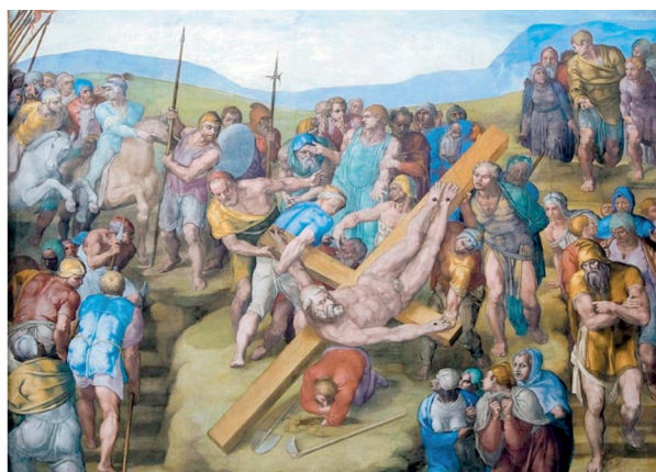
Figure 1. The Crucifixion of Saint Peter fresco (1546-1550) [Dimensions: 625 x 661 cm]. Michelangelo Buonarroti, Cappella Paolina , in the Vatican City, Rome.

The fresco that chronicles The Crucifixion of Saint Peter was painted by Michelangelo Buonarroti in the Cappella Paolina , in the Vatican City between 1546 and 1550, it represents one of the artist's principal works (Figure 1). 14 With a detailed analysis of this famous piece, it can be seen that at the bottom of the