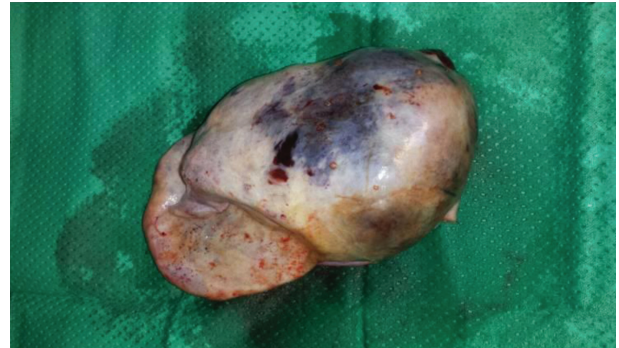
Figure 2. Postoperative enlarged ovarian mass with large areas of necrosis and hemorrhage mixed with solid and cystic components

CD30 and placental alkaline phosphatase (PLAP). Peritoneal washing cytology and multiple biopsies of the peritoneum and omentum were negative.