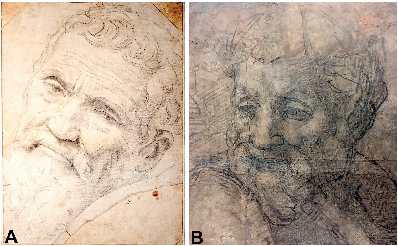
Figure 2. (A) The face of Michelangelo Buonarroti drawn by Daniele of Volterra in 1550-1552 [Dimensions: 29.5 x 21.8 cm, Teylers Museum, Haarlem, Netherlands ]. (B) Detail of the cartoon of the Epifania showing St. Joseph's face. Note St. Joseph's face has the same facial features as Michelangelo, such as: the drooping eyelids of old age, the rounded face, the broad forehead, the flat nose, the thin eyebrows, the thin lips, the shape of the hair and the forked beard