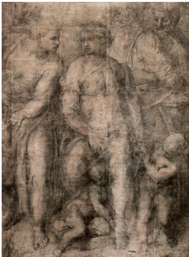
Figure 1. The cartoon of the Epifania (Michelangelo Buonarroti, Black chalk - Dimensions: 232.7 x 165.6 cm, 1553, British Museum, London, England)

Closer analysis, using a high resolution image, shows that the face of the supposed figure of St. Joseph