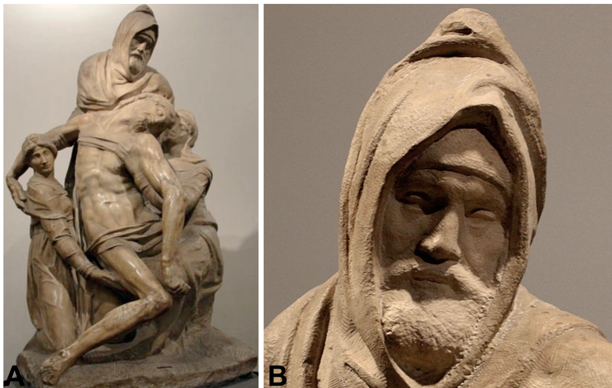
Figure 4. (A) Pietà de Bandini , made by Michelangelo Buonarroti in 1550-1555. (B) Note the face of the hooded man [ Nicodemus ] it is in fact a self-portrait of Michelangelo Buonarroti with drooping eyelids, highlighting his weak eyesight [ Museo dell'Opera del Duomo, Florence, Italy ]

tive behaviour (1) saw himself physically, especially in his old age.