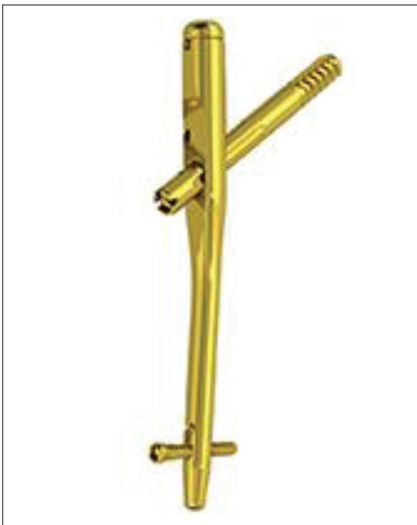
Figure 3. Eba One Nail

Proximally to the hole of the cephalic screw there is another hole, dedicated to the insertion of a k-wire parallel to the cephalic screw which thus allows the