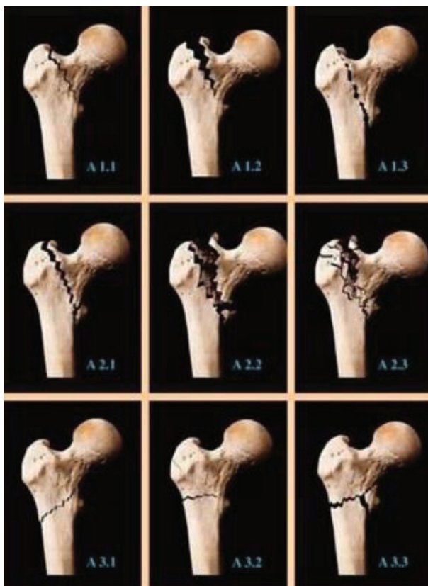
Figure 2. AO classification

Surgery is still considered as the gold standard of treatment in this elderly, frail patient cohort (7, 8), with the time to surgery parameter to be a determinant in terms of mortality rate and functional recovery (9).