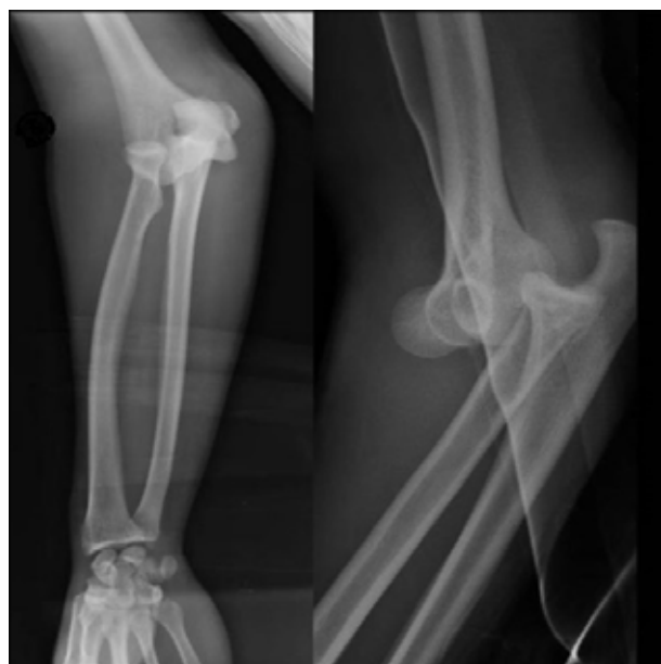
Figure 1. Patient's x-rays at his arrival at Emergency Department revealed a closed posterior dislocation of the left elbow.

A right-hand-dominant 42-year-old man was admitted to our Emergency Department having sustained a fall from a standing height on his left arm during a football match, one hour earlier. He presented to us with a clear elbow deformity, swelling and persistent paresthesia of the hand. Even if the hand remained warm and pink and seemed to conserve a good capillary refill, no radial and ulnar pulses could be traced at the wrist. X-rays revealed a closed posterior dislocation of the elbow, without associated fractures (fig.1). Immediate closed reduction was performed, obtaining the restoration of the joint congruity and the resolution of the hand paresthesia. Nevertheless, the weakness of the radial and the ulnar pulses persisted, and the Color Doppler Ultrasound evaluation revealed a sub-acute ischemia of the forearm, caused by the thrombosis of the brachial artery. He was urgently taken to the operating room for a surgical exploration : a 4-centimetre rupture of the brachial artery was found proximally to the split into its radial and ulnar branches. Both the proximal and the distal extremities of the damaged artery appeared to be torn and bruised (fig.2-a).