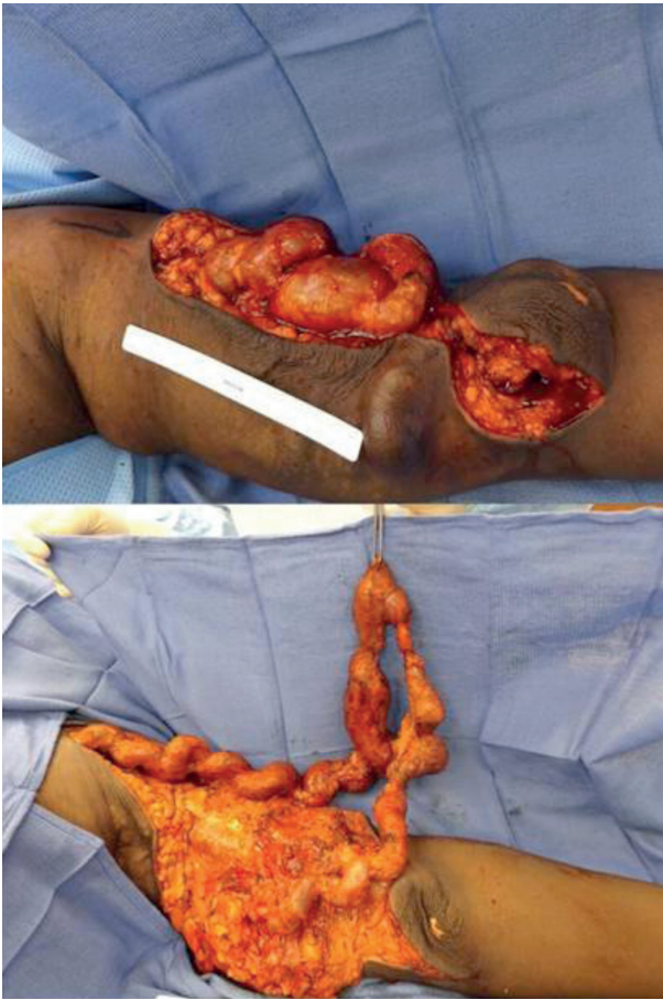
Figure 3. Intraoperative photographs of the giant arteriovenous fistula with s-shaped incision to release aneurysm