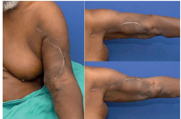
Figure 5. Postoperative photographs 2 months after open surgical arteriovenous fistula aneurysm repair

Hemodialysis vascular access adverse effects account for more than 20% of hospitalizations for patients with end-stage renal disease (3). The adverse