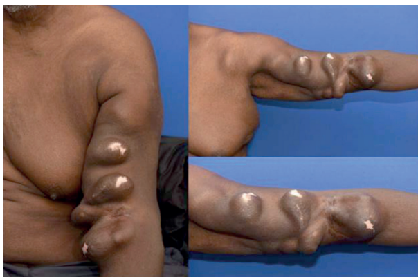
Figure 2. Preoperative photographs of brachiocephalic arteriovenous fistula aneurysmal degeneration

Abbreviations: PAP, primary assisted patency; SP, secondary patency