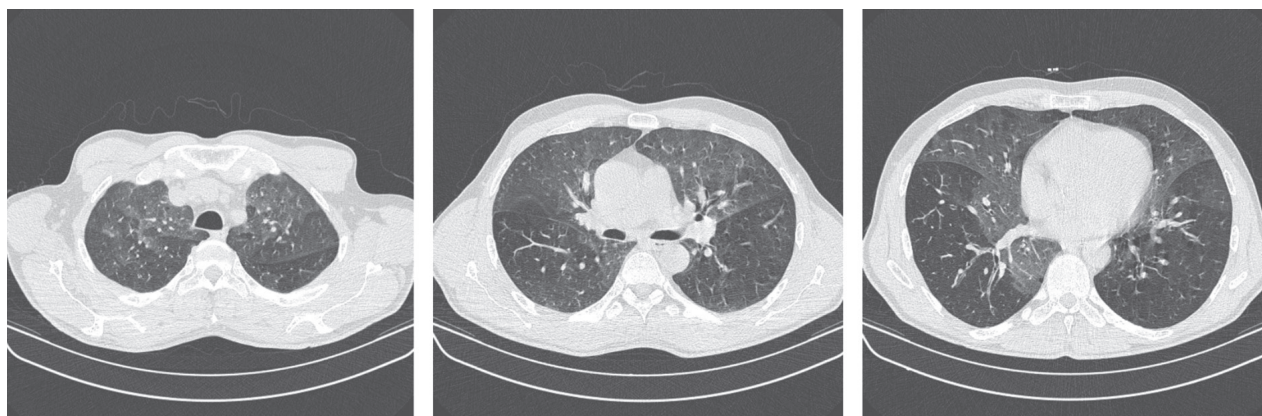
Figure 1. HRCT performed at first HP/EAA relapse, patchy ground-glass opacities and patchy areas of mosaic perfusion, more profuse at the apices, without evidence of nodular lesions. The image, without contrast media, evidenced some reactive lymph node (diameter <15 mm) at the lung ila

Stating the increased viral count, in February 2014 the antiviral therapy was improved adding a third medication (i.e. emtricitabine 200 mg/tenofovir disoproxil fumarate 245 mg s.i.d.). In the following months, viral load dropped to a non-detectable status and CD4+ count reached 661 cells/ \mu L (March) and eventually 787 cells/ \mu L (April). Unfortunately, HP/EAA symptoms newly relapsed: in May 2014, the patient contacted his occupational physician, who reported diffuse crackles at the upper lung fields, associ-