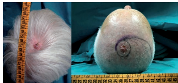
Figure 2. A 78-year-old man with a nodular cSCC (G2; thickness, 2 mm) on the scalp. We performed surgical excision under local anesthesia, with safety margins of 10 mm. The resulting defect was covered with a rotation flap

veloped a surgical wound infection. Weekly dressing was used to treat all these postoperative complications until closure of the wound was achieved. The follow-up (range: 3-25 months) included a clinical examination at every 6 or 12 months during the next 2 years for cSCC in situ, a clinical examination at every 6 months during the next 2 years and an annual ultrasound examination for the next 3 years at T1, T2 (G2) and in addition an annual chest x-ray from T3. During the follow-up, no patient showed the presence of recurrences or metastases.