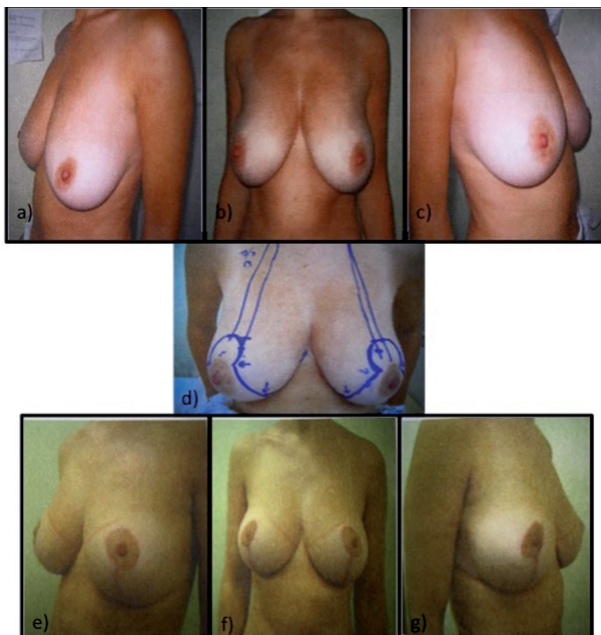
Figure 1. A 37-year old female patient, who undergone medial-pedicle-based reductive mammoplasty with vertical skin resection pattern. The base of the medial pedicle was 6-cm width. The weight of the breast excised was 250 gr on the left and 270 gr on the right. The patient is shown preoperatively (a, b, c, d) and at 6° month after surgery (e, f, g)

We performed 54 breast reductions using the medial pedicle technique, from January 2012 to June 2015; 36 with a Wise pattern skin resection and 18 with a vertical one. There was no need for free-nipple graft.