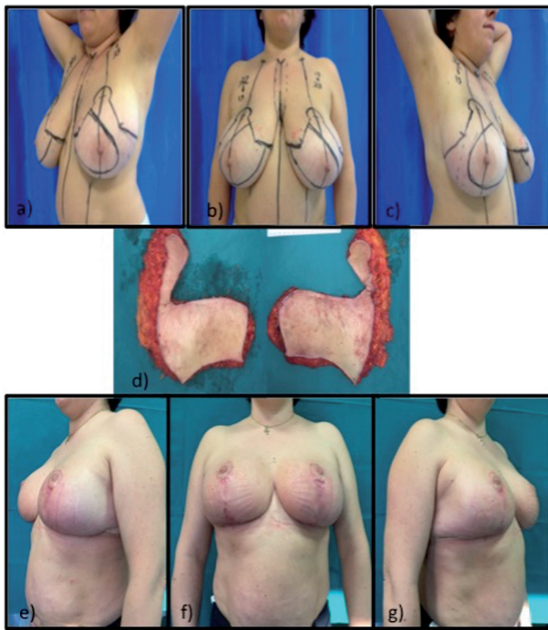
Figure 3. A 47-year old female patient, who undergone medial-pedicle-based reductive mammoplasty with Wise skin resection pattern. The base of the medial pedicle was 10-cm width. The weight of the breast excised was 1160 gr on the left and 1150 gr on the right. (g) The patient is shown preoperatively (a, b, c) and at 6 o month after surgery (d, e, f)

The mean weight of breast excised was 540 g on the left (range, 207 to 1160 g) and 564.8 g on the right (range, 215 to 1150 g). At the 6 th -month follow-up after surgery, the mean suprasternal notch to nipple distance obtained was 21.4 cm (range, 19-23 cm) on the left and 21.8 cm (range, 19-23 cm) on the right.