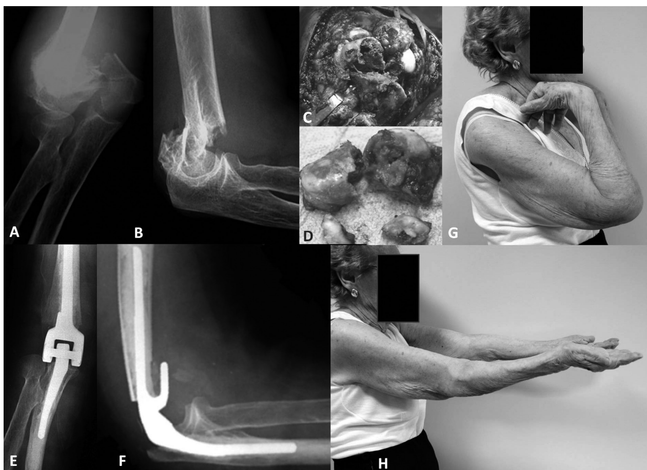
Figure 1. Type C3-3 right distal humerus fracture; preoperative x-rays (A and B), intraoperative views (C and D), radiographs (E and F) and clinical evaluation (G and H) 91 months after surgery (MEPS: 90; excellent result).