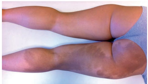
Figure 1. A typical café-au-lait lesion on the right buttock and thigh which demonstrates jagged “coast of Maine” borders and the tendency to respect the midline

MAS was originally described by McCune and Albright in 1936 (5) and 1937 (6) as the association of polyostotic FD, café-au-lait skin pigmentation and precocious puberty. It was later recognized that oth-