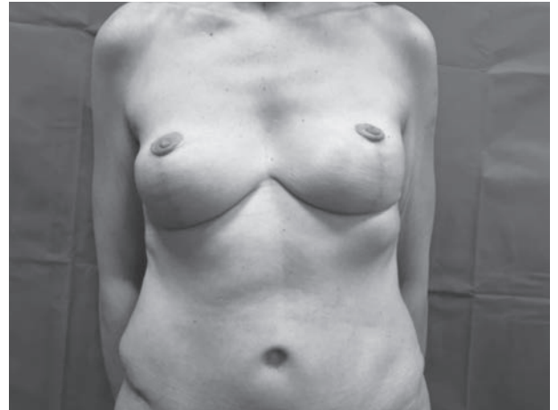
Figure 1-2. Patient with II degree ptosis: pre-operative and 12 months post-operative photos, after a superior pedicle with auto-augmentation technique