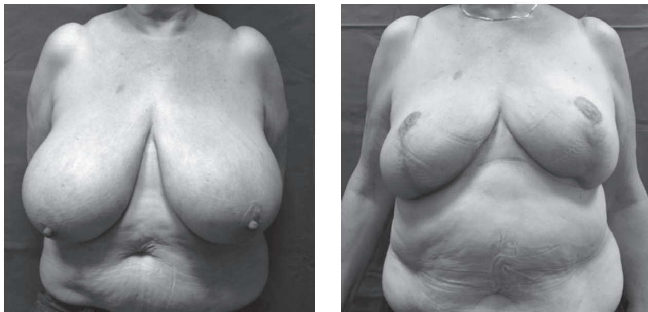
Figure 5-6. Patient with III degree ptosis: pre-operative and 12 months post-operative photos, after a Thorek technique

and the mean surgical time has been 3:15 h (range from 1:45 to 4:30 h) (Tab. 2). All the patients underwent breast reshaping after almost six months since the stabilization of their weight. We observed minor complications and none major ones, not affecting negatively on patients' satisfaction; in particular: delayed wound healing (19,44%), unfavorable scarring (13,89%), seroma (2,78%), hematoma (2,78%), skin necrosis (5,55%), partial nipple loss (5,55%) and total nipple loss (2,78%) (Tab. 3).