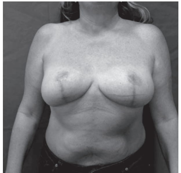
Figure 3-4. Patient with III degree ptosis: pre-operative and 12 months post-operative photos, after an inferior pedicle technique