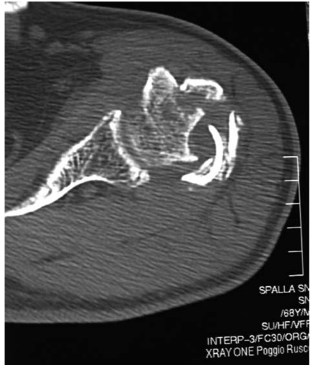
Figure 3. CT image of the fracture