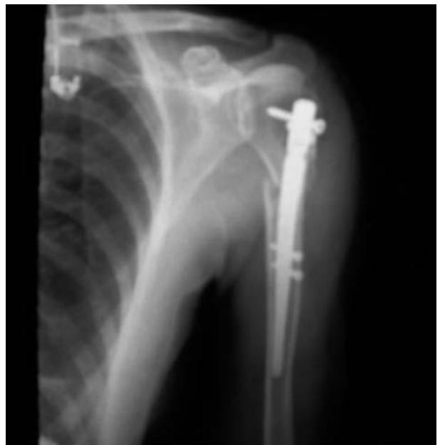
Figure 4. Surgical synthesis of the fracture with a Polarus nail