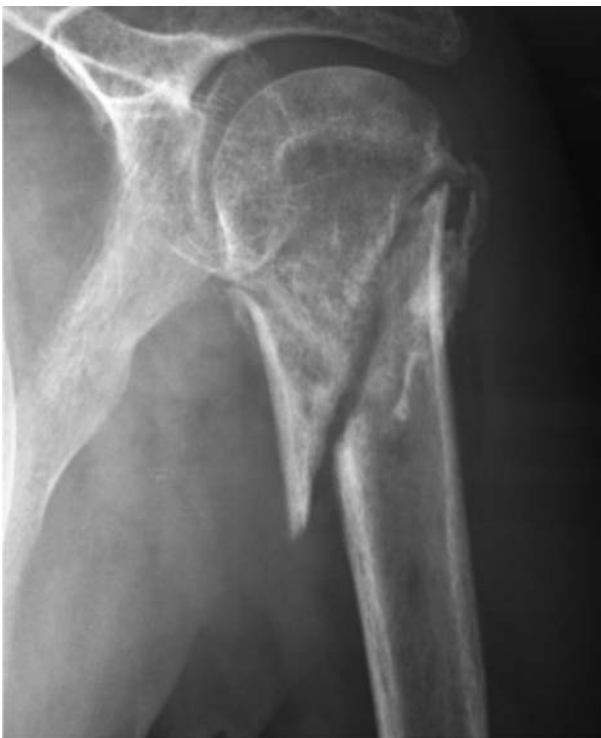
Figure 2. A 2 fragment fracture of the humeral head-neck