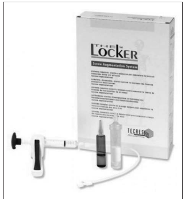
Figure 5. The Locker System for Augmentation

The objective is to increase the biomechanical stability of the implants, reducing complications due to