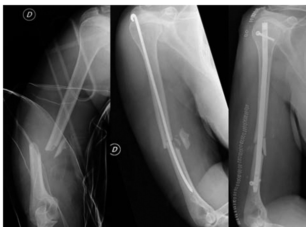
Figure 1. Fracture of the middle third of the humerus in the left picture, in the middle picture urgent stabilization with intramedullary Rush nail, in the picture on the right the stabilization with locked intramedullary nail during the simultaneous revisi

The same day the patient is brought to surgery room for orthopedic surgery of the lower limbs and right humerus. The right lower limb is stabilized with external fixation in tibiofemoral bridge, some fragments of the tibia are stabilized with Kirschner wires.