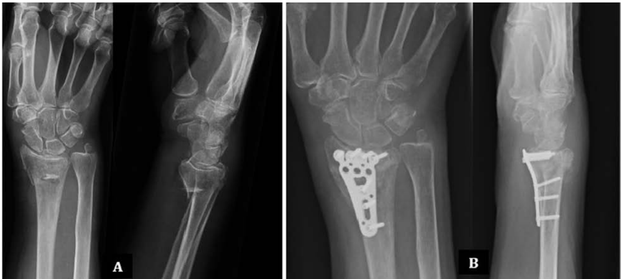
Figure 3. A: 65 years old woman with many fragments fracture of the distal radio. B: radiographic check 3 months after surgery: synthesis with angular stability plate Aptus Radius

recovery (16). Thanks to the fixation of the screw with multi-angle and two lines of cortical screws, characteristics in the plate with variable holes, you can get an optimum recovery of the articular surface. The fixing of articular central surface is guaranteed from the distal line, the dorsal subchondral support from the proximal line. implants with screws with angular stability have many advantages compared to previous systems without stability screws: distal screws, integral with the plate, allow, on one side, a stabilization of the implant against lateral movement and, on the other side, a greater resistance to the easing of the screws. Thus comes to be constituted a “shelf” support under the distal radial articular fractured surface.