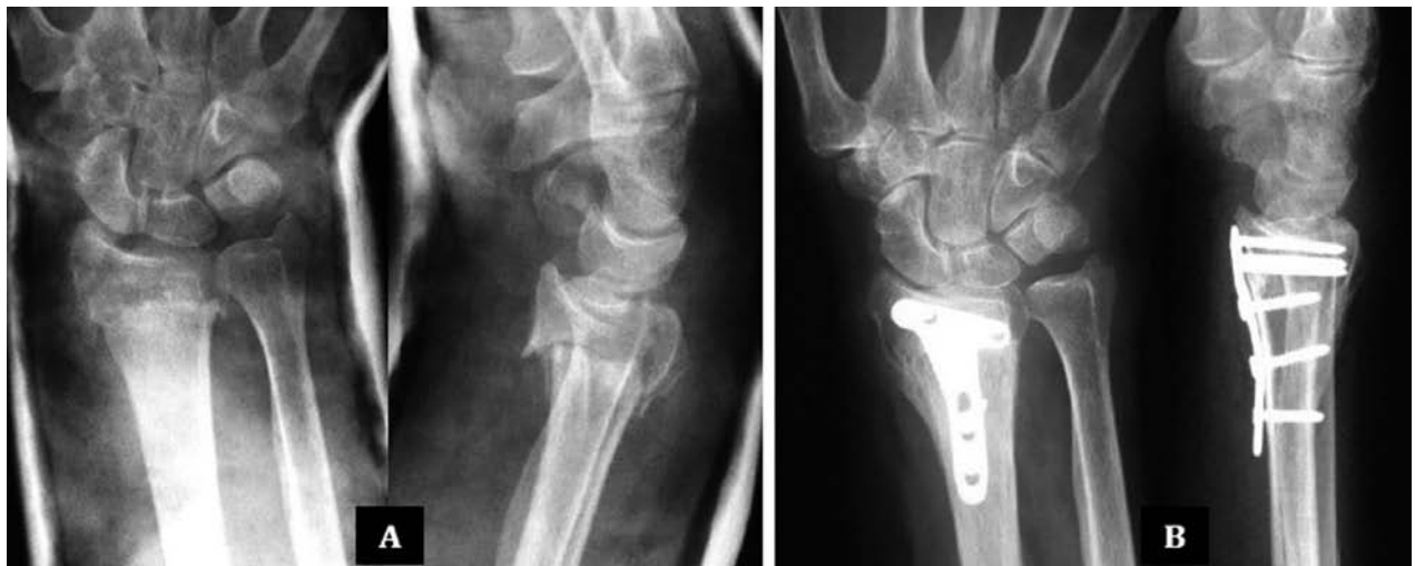
Figure 2. A: 56 years old woman with articular fracture of the distal radio. B: radiographic check 6 months after surgery: synthesis with angular stability plate Synthes LCP

The goal of surgery in fractures of distal radius is the same of all the articular fractures: reconstructing the normal articular surface and maintain mobility and function. Leung and other colleagues, in their randomized trial, that compares the stabilization with an external fixator with a volar plate, declare that the open reduction leads to better results (14, 15). After 24 months of follow-up, the results for the fixing unit were significantly better than those of external fixation according the Gartland-Werley score. Mehling and colleagues, using multidirectional plates and screws in their work concluded that the treatment of unstable fractures of the distal radius with this system ensures a stable internal fixation and allows a rapid functional