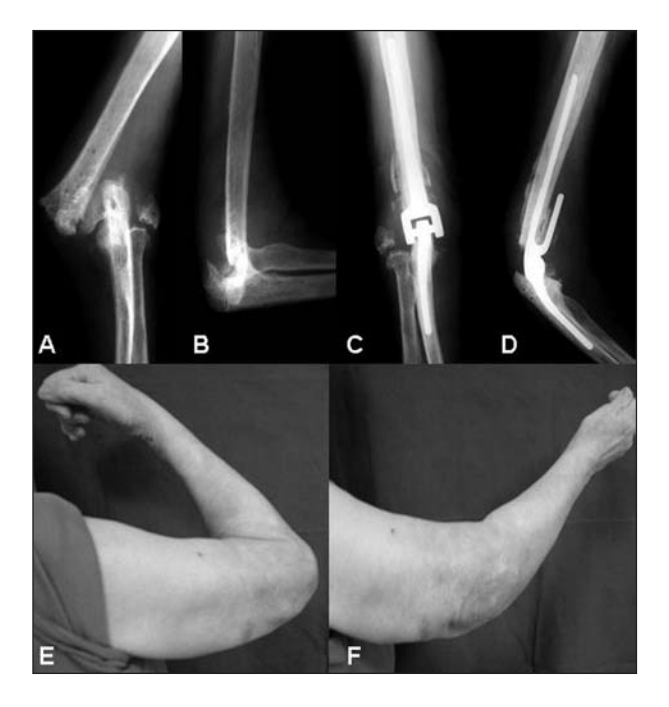
Figure 2 . Type "T-condylar" non-union of the right elbow; pre-operative x-ray (A, B), x-ray (C, D) and clinical evaluation (E, F) at follow-up. (excellent result).

thetic revision. Finally, in two patients a transitory impairment of the ulnar nerve, which resolved spontaneously, was observed.