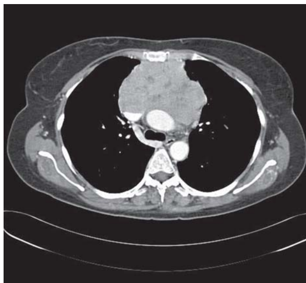
Figure 1. Computed tomography of the thorax showing a mass in the anterior mediastinum

During hospitalization parenteral steroid therapy was administered with prompt improvement of the