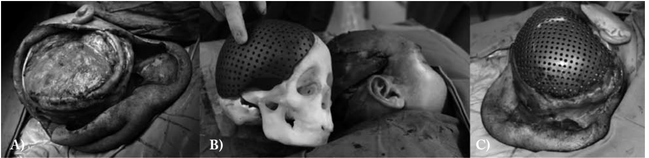
Figure 4. Intraoperative views. A: The expanders were removed and dissection was finished. B: The individualized titanium prosthesis on the top of a skull model. C: The prosthesis was fixed on the skull.