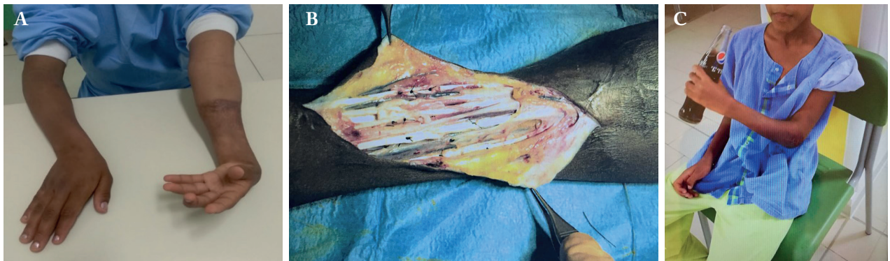
Figure 3. Moderate case treated by FDS pro FDP transfer: A-preoperative, B-intraoper., C-Result.