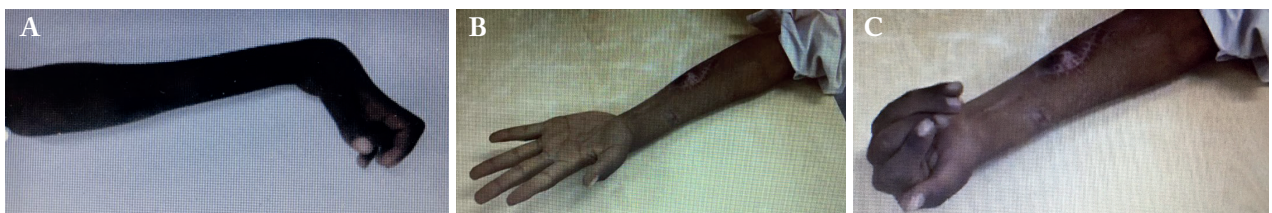
Figure 4. Moderate case treated by FDS and FDP lengthening: A-clinical presentation, result in B and C.