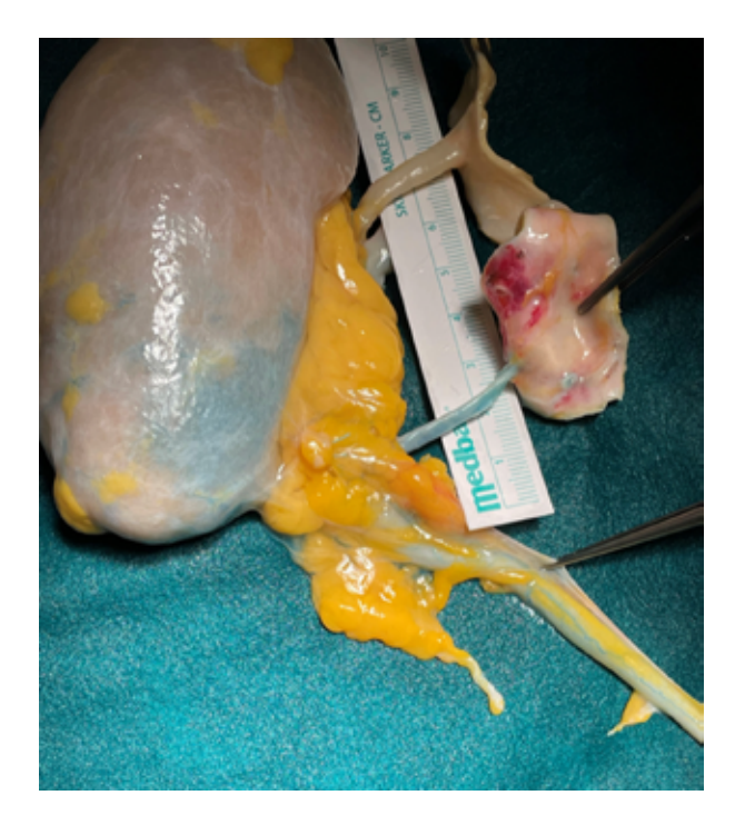
Figure 3. Small arterial branches on the upper ureter are recognizable after the injection of the solution in the inferior polar artery.

Beforehand, in our opinion, all MRAs should be studied and always ought to be preserved. Particular attention should be paid to the arteries whose perfusion concerns the lower pole. The arterial blood supply of the proximal ureter can occasionally rely also on MRAs. Figure 2 and Figure 3 are showing a case of our series where the upper ureteral trunk appears to be colored after injection of the methylene blue dye into the inferior MRA from the aortic patch. The ligation of an accessory branch supplying the ureter, as presented, could lead to a high risk of ureteral ischemia or necrosis. For instance, we report a case where the inferior MRA preservation was not possible to be achieved due to technical difficulties. After the successful completion of the procedure, the patient developed a severe ischemia and necrosis of the upper ureter requiring ureterostomy and lately re-transplantation.