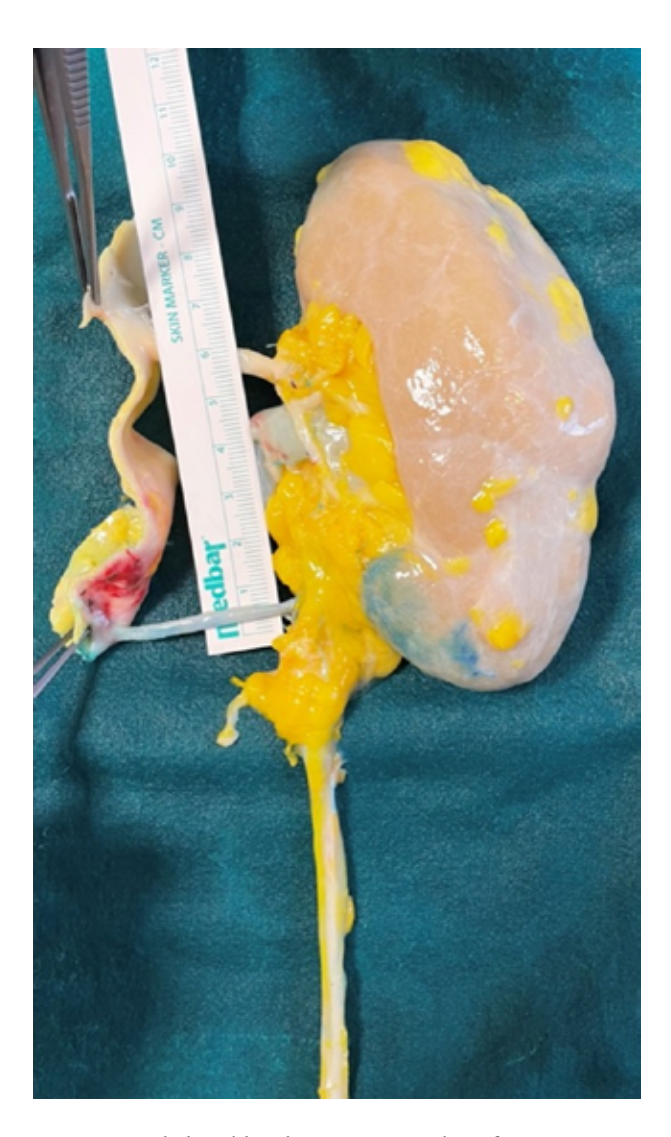
Figue 1. Methylene blue dye injection in the inferior accessory renal artery evidences the area of perfusion.

While preparing the donor's kidney for transplantation in a sterile ice bath at the back-table, Methylene Blue (Byam, Paris, France), diluted 1/50 in Celsior Solution (approximately 40 cc) is injected through the aortic patch to visualize the area of vascular supply from the accessory renal artery of interest over the kidney surface. Few seconds after injection, are sufficient to evidence the extension of the polar renal artery territory. Figure 1. While the parenchyma appears the first to be colored, the vascularization of