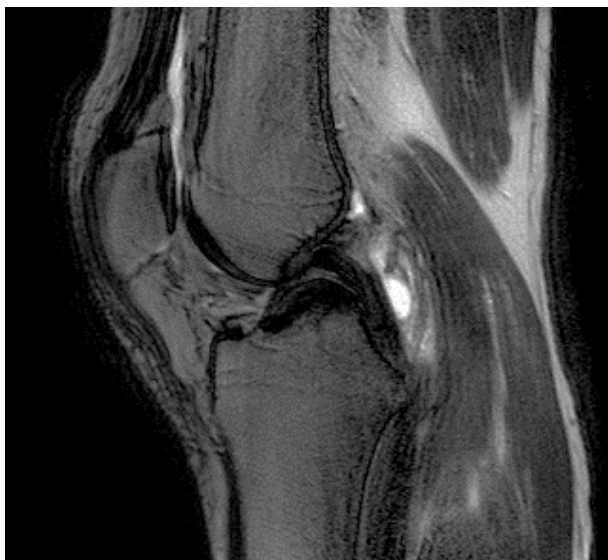
Figure 2: Same case of Figure 1, pre-operative MRI shows the “double PCL sign” (arrow shows PCL, arrowhead shows the meniscus tear)

In the present review, except for the oldest studies dating back to a period before the application of MRI, every injury that we considered was diagnosed through MRI. Both Nooh and Shea found the double PCL and the intercondylar notch sign in their cases, Bloome described a medial meniscus tear displaced into the notch in one of the two cases, while in the other cases details about MRI findings were not reported (8,11,15).