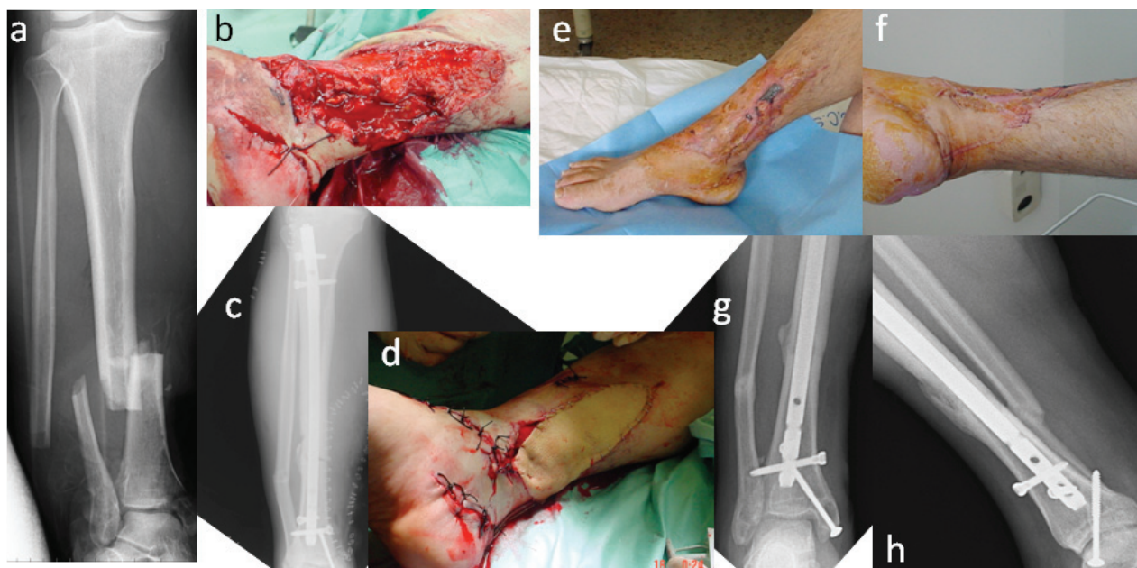
Figure 1. Gustilo IIIB tibial shaft fracture treated one-stage with nail and a dermo-epidermal skin graft. a+b) pre-operative; c+d) post-operative; e+f) skin wound at the 3-month follow-up; g+h) 6-month follow-up x-ray

A different scenario was found in the group of open tibial plafond fractures. As reported in Table 2, the plafond fractures were associated with a complex fracture pattern in all cases, regardless of the grade of bone exposure. However, no Gustilo I was found; this could be explained with the mechanisms of injury of these fractures, which frequently include a crushing trauma with severe soft tissue involvement. One-stage ORIF was performed in 4 patients for the treatment of 2 Gustilo II and 2 Gustilo IIIA plafond fractures. NPWT was needed in 2 cases to manage the skin necrosis occurred within one week after the surgery and was prolonged up to 5 weeks before obtaining the complete wound healing. The remaining 9 patients who reported a Gustilo II and IIIA fracture were firstly treated with External fixation. The switch from External Fixation to ORIF was performed within 21 days after the first surgery for the Gustilo II fractures, and from 20 to 30 days after the surgery for the Gustilo IIIA fractures. The x-ray complete fracture healing was 6 to 8 months, longer than what observed for shaft fractures (4 months). The overall percentage of complications was 41,6% and included: a delayed