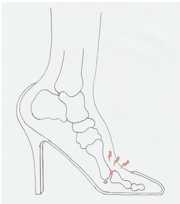
Fig. 2 High-heeled shoes transfer greater pressure and stress to the forefoot and this can increase the conflict on the dorsal aspect of the first metatarsophalangeal joint and therefore painful symptoms.

Similarly, McMurray (55) in 1936, identified ill-fitting shoes as the cause of this adolescent condition when he wrote, “In adolescence the condition is usually found in association with a long foot which is narrower than normal, and examination of the great toe shows that the power of dorsiflexion is lost.” Then, Bingold (15) and DuVries (4) mentioned footwear that is too short, Lorimer et al. (56) footwear that is too loosely fitting and Cracchiolo (57) footwear that induces hyperextension of the big toe as a cause of HR. Some authors referred that HR patients even exhibited an intolerance to footwear (58, 59).