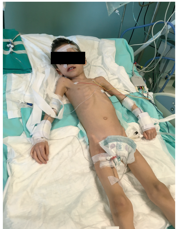
Figure 1. Clinical conditions of the child, showing severe underweight status, upon arrival in Intensive Care Unit

He was then referred to the intensive care unit and intravenous fluids, insulin and potassium replacement were started according to the local protocol for the management of DKA (6).