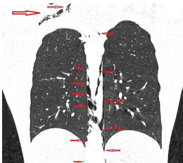
Figure 2. CT scan showed widespread emphysema and pneumomediastinum extend to paraspinal regions.

complete resolution of air (Figure 3), and the patient was discharged home at the fourth day of admission. He was prescribed to take Budesonide 200 µg bid with the help of the AeroChamber device, and to avoid strenuous exercise to prevent a pneumothorax or airway bullae from developing.