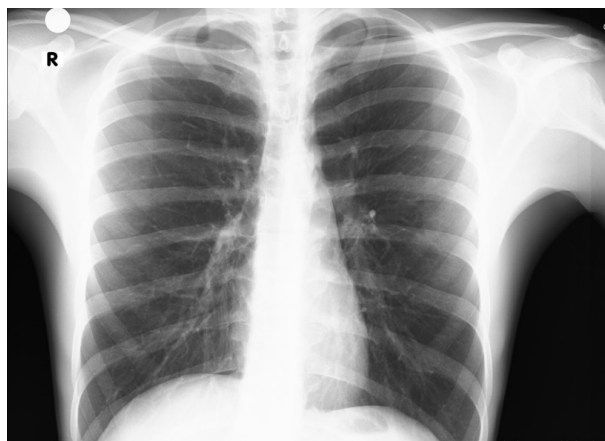
Figure 3. Repeat chest radiograph showed a significant reduction in the pneumomediastinum after 4 days.

The clinical presentation of SPM can vary widely, and ranges between mild symptoms to the potentially fatal Sudden Respiratory Distress Syndrome (ARDS). The patients most commonly complain of chest pain, odynophagia, subcutaneous emphysema, symptoms of varying degrees of mediastinal pressure (dyspnea, bruising), and symptoms of pneumothorax (12).