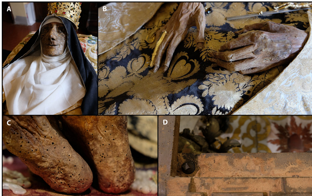
Figure 1. The mummified remains of Santa Maria Maddalena de' Pazzi. A) the overmodelled head; B) detail of the hands; C) the damaged feet; D) the affected coffin.