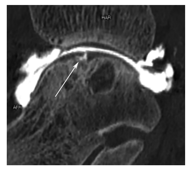
Figure 4. Arthro-CT of the right ankle, MPR sagittal image, in 36 years old female with results of chondral scaffold implant 12 months earlier, in result of focal osteonecrosis of the talus medial edge. Wide "chondral defect", in correspondence of the implant, in agreement with grade 4 of the modified IRCS classification (arrow)

moderate entity due to the onset of adhesive capsulitis (20%).