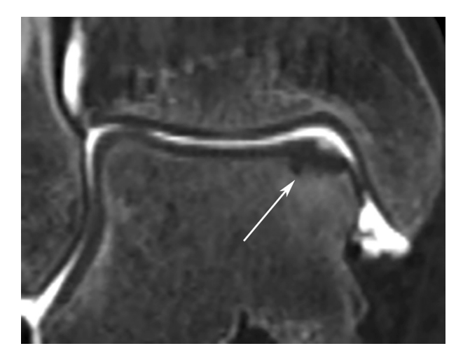
Figure 2. Arthro-CT of the right ankle, MPR coronal image, in 55 years old male with results of autologous chondrocytes implant 12 months earlier, in result of focal osteonecrosis of the talus medial edge. Focal and superficial mdc impregnation, in correspondence of the chondral implant, in agreement with grade 1 of the modified IRCS classification (arrow)